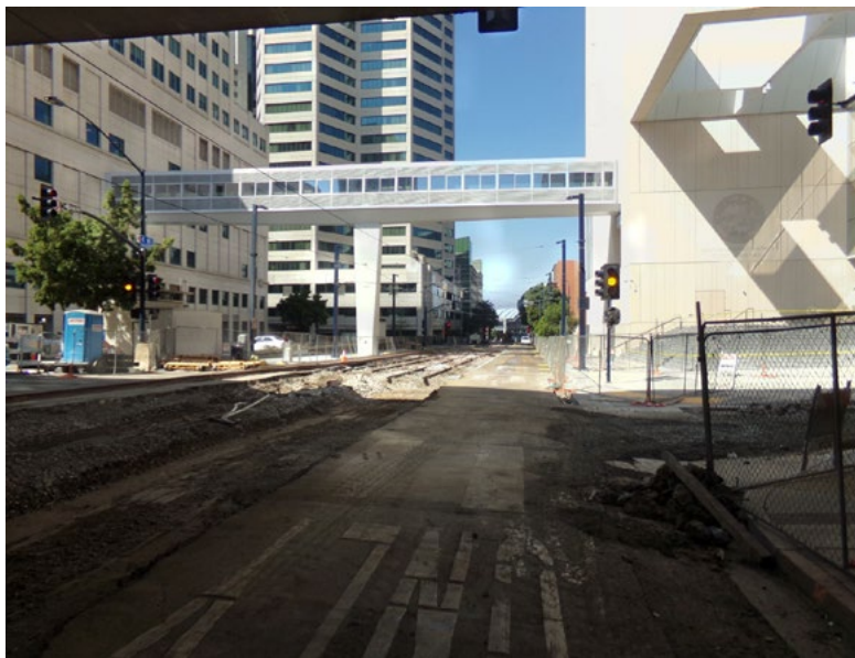
Figure 3. This Image Shows the Courthouse Station at the Beginning of Construction