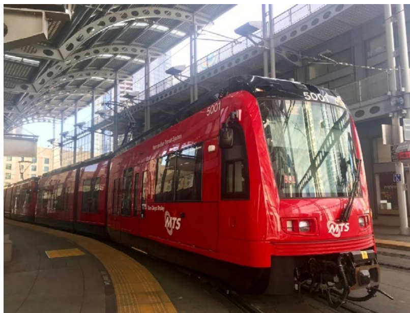
Figure 2. This Image Shows the Trolley After Assembly