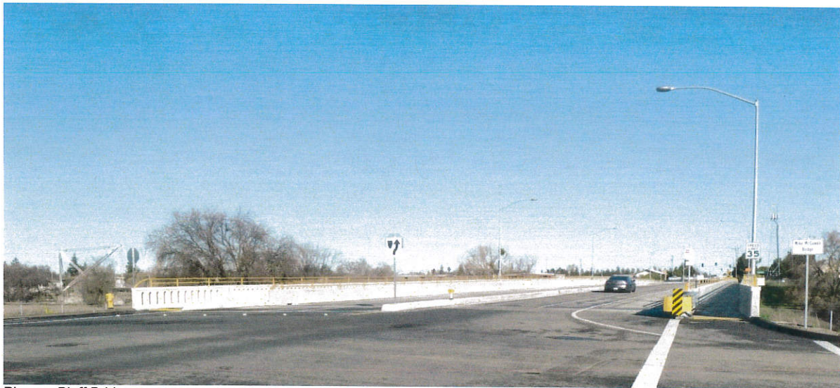
Pioneer Bluff Bridge

Prepared By: Office of State Audits and Evaluations California Department of Finance