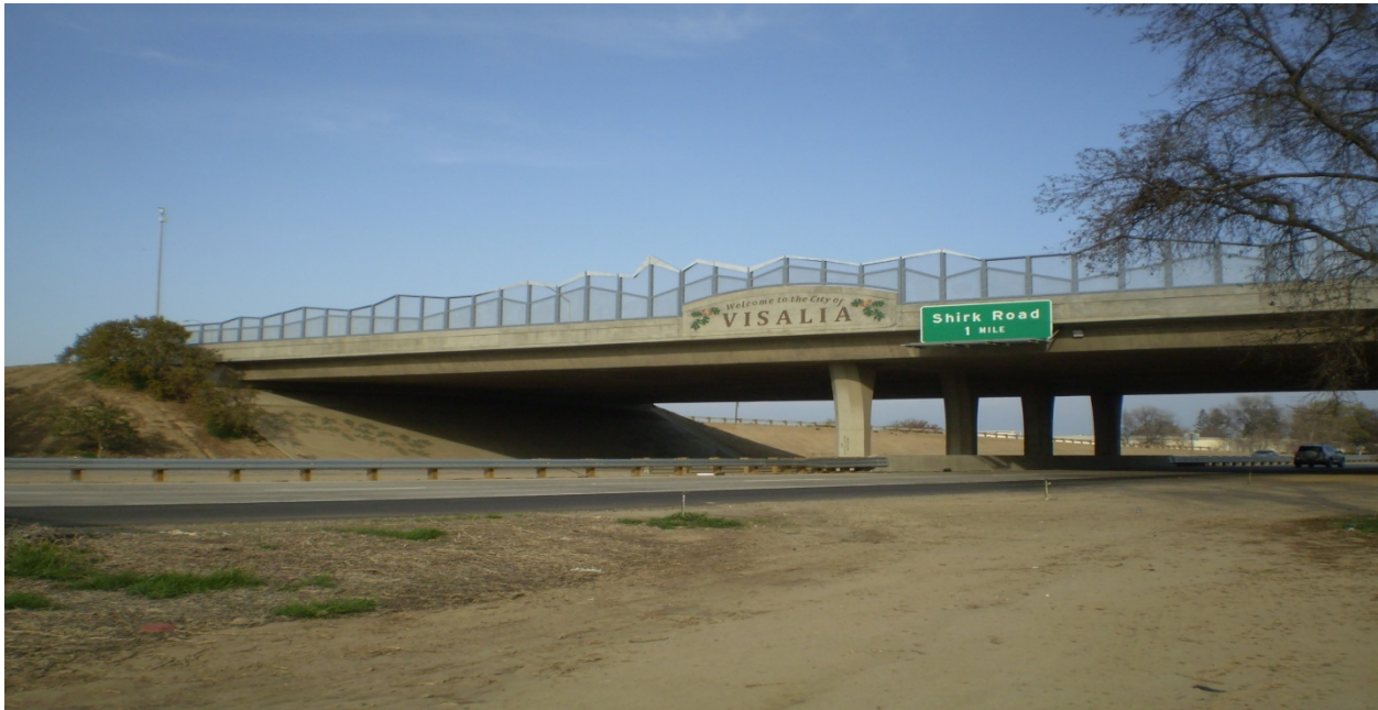
Visalia Bridge Airport Drive and SR 198

Prepared By: Office of State Audits and Evaluations California Department of Finance