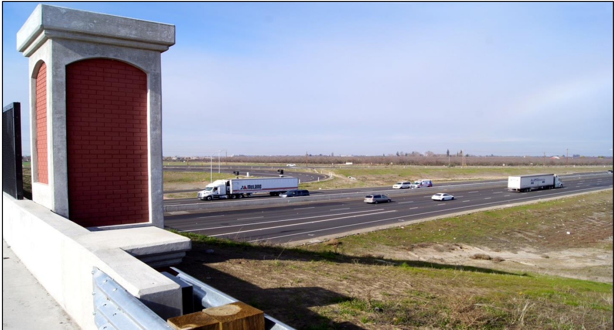
State Route 99

Prepared By: Office of State Audits and Evaluations California Department of Finance