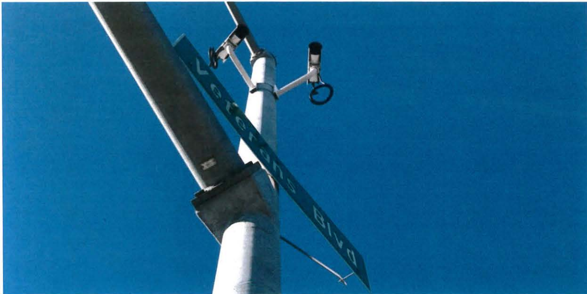
Smart Corridors Project

Prepared By: Office of State Audits and Evaluations California Department of Finance